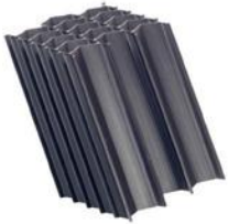
TUBE SETTLER MEDIA