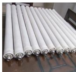
FINE BUBBLE DIFFUSERS