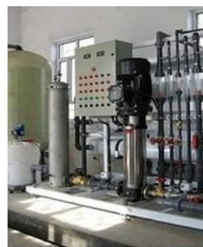
INSTITUTIONAL RO PLANT

(Seawater Desalination Reverse Osmosis Plant)