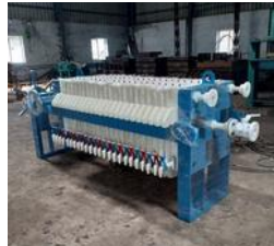
PLATE & FRAME TYPE FILTER PRESS