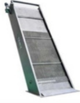
MECHANICAL BAR SCREEN