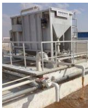
INDUSTRIAL ETP PLANTS