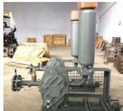
TWIN LOBE AIR BLOWER