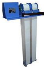
BELT TYPE OIL SKIMMER