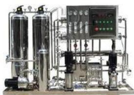
SS RO Plant