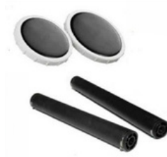
COURSE BUBBLE DIFFUSERS