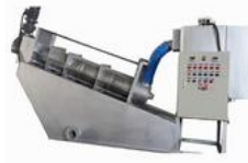
SLUDGE DEWATERING SCREW PRESS