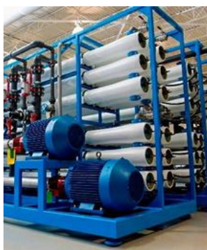
INDUSTRIAL RO PLANTS