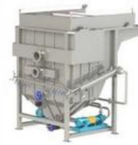
DISOLVE AIR FLOATATION SYSTEM