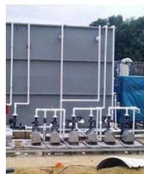
Compact / Portable ETP

(Compact / Portable Effluent Treatment Plants)