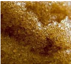
ION EXCHANGE RESIN