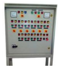
ETP & STP PANEL